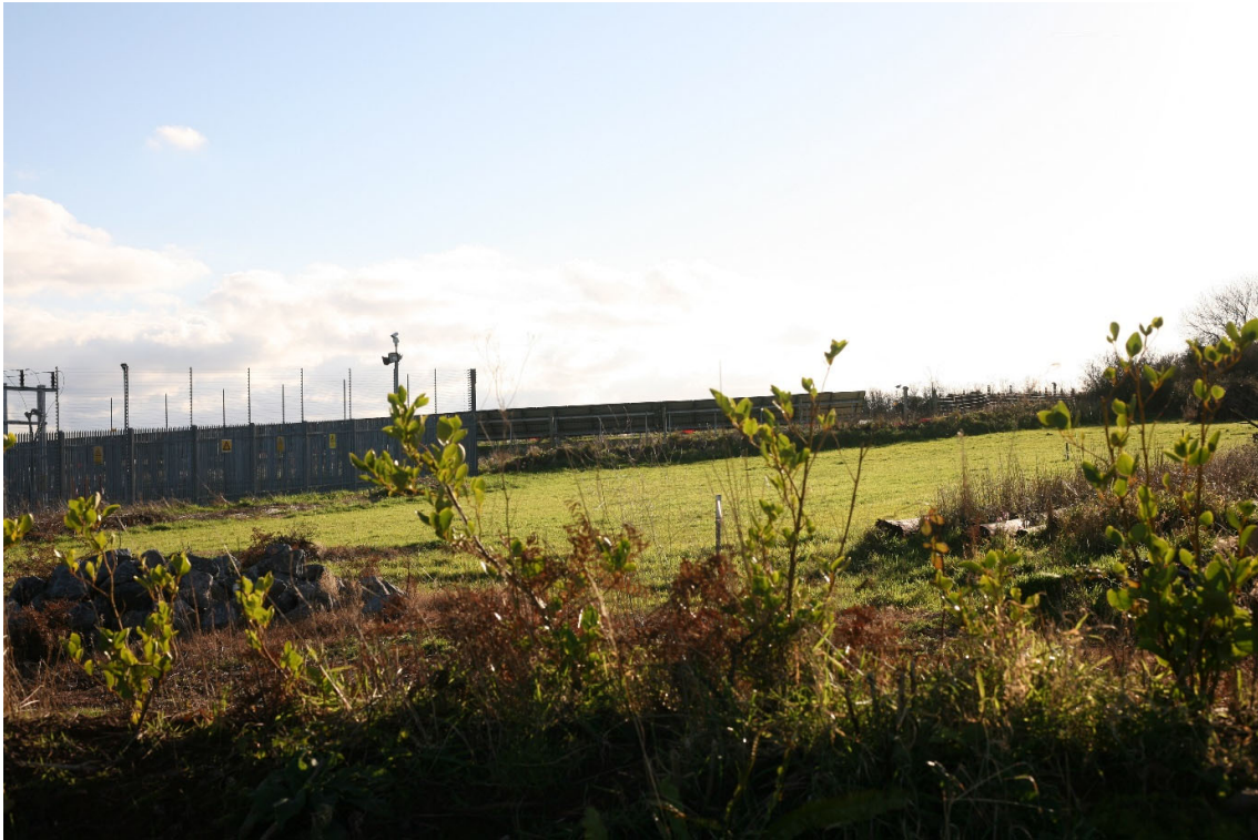
Photograph 4: Back of existing Mylett's Hill solar panels

Part B - Illustrative photograph showing the appearance of panels from the back